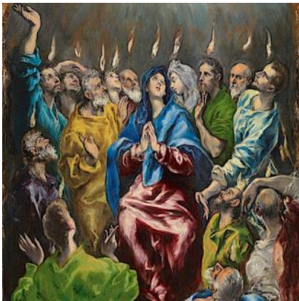
El Greco (Domenico Theotocopuli) The Pentecost, detail c 1600

“While Peter was still speaking these things, the Holy Spirit fell upon all who were listening to the word (First Reading).