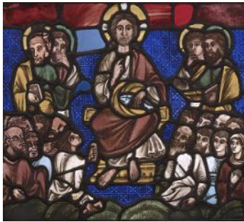
Christ Feeding the Five Thousand Late 12th to early 13th century

“So they collected them, and filled twelve wicker baskets with fragments from the five barley loaves” (Gospel).