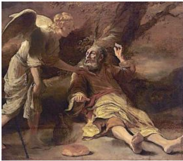
Ferdinand Bol Elijah fed by an Angel Painted between 1660 and 1663

“But the angel of the Lord came back, touched him, and ordered, “Get up and eat, else the journey will be too long for you ” (First Reading)!