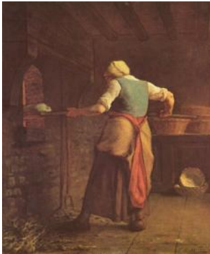
Jean François Millet Woman Baking

“The bread that I will give is my flesh for the life of the world” (Gospel).