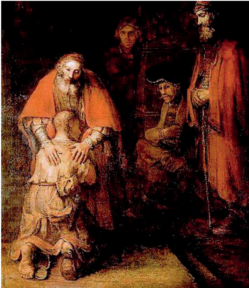
Rembrandt The Return of the Prodigal Son

Theme: “Father, I have sinned against heaven and against you. I no longer deserve to be called your son” (Gospel).