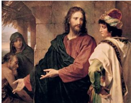
Heinrich Hoffmann Christ and the Rich Young Ruler 1889

“Jesus, looking at him, loved him. And said to him,” you are lacking in one thing. Go, sell what you have, and give to the poor” (Gospel).