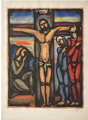
George Rouault Crucifixion, 1920

“Can you drink the cup that I drink or be baptized with the baptism with which I am baptized” (Gospel)?