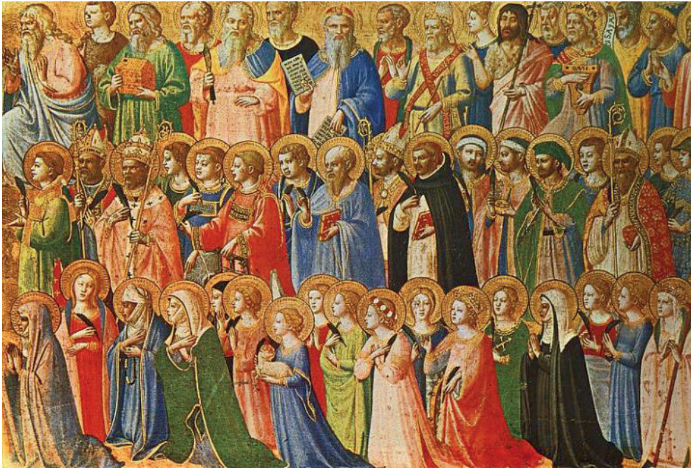
Fra Angelico, The Forerunners of Christ with Saints and Martyrs 1423-24

Theme: “Rejoice and be glad, for your reward will be great in heaven” (Gospel).