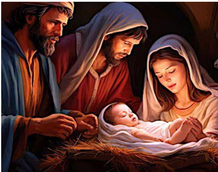
In the beginning was the Word, and the Word was with God, and the Word was God. ( Gospel )