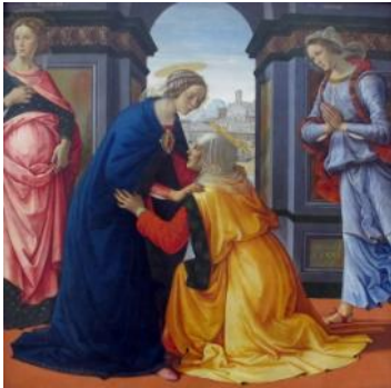
Domenico Ghirlandai, The Visitation.

“When Elizabeth heard Mary’s greeting, the infant leaped in her womb, and Elizabeth [was] filled with the Holy Spirit” (Gospel).