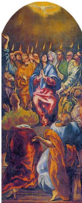
El Greco, Pentecost Museo del Prado Madrid ca 1596

Theme: "Then there appeared to them tongues as of fire ... " (Gospel)