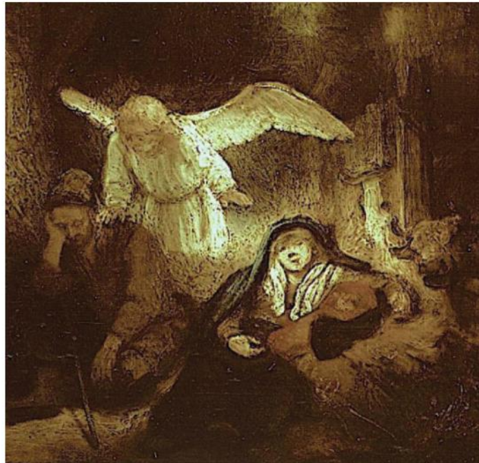
Rembrandt "The Dream of St. Joseph" c. 1650-55

Theme: "It is through the Holy Spirit that this child been conceived in her" (Gospel).