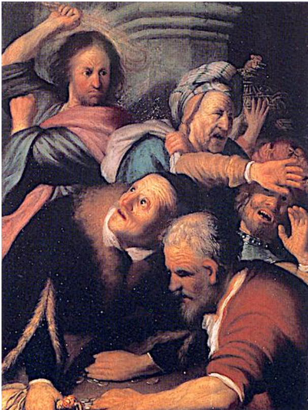
Rembrandt Van Rijn Christ Driving The Money Changers From The Temple 1635

Theme: "He made a whip out of cords and drove them all out of the temple area, and spilled the coins of the money changers" (Gospel).