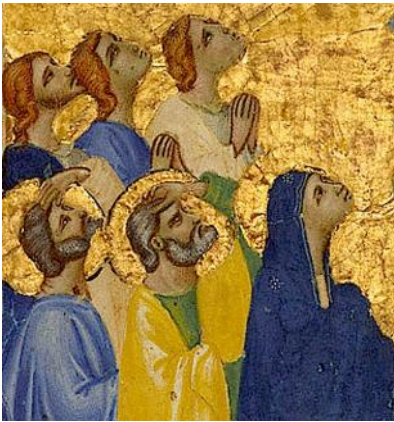
The Ascension of Christ Pacino di Bonaguida about 1340*

"So then the Lord Jesus, after he spoke to them, was taken up into heaven and took his seat at the right hand of God" (Gospel).